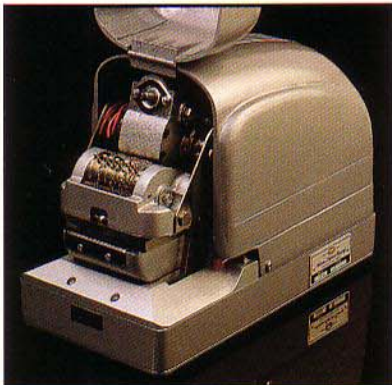
Dimensions: 6 1/2" x 13" x 10" Weight: 43 lbs.

Our most popular portable electric perforator has changeable dates and/or numbers on the second line , while the first and third lines can be used for up to 10 fixed characters or numbers. The Model 400 can be ordered with one, two, or three lines for perforation. Standard "PAID" and "DATE" perforation is readily available.